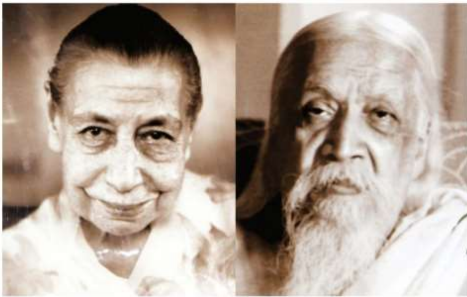
THE MOTHER SRI AUROBINDO

“Let us keep flaming in our heart the fire of progress, higher always higher.”