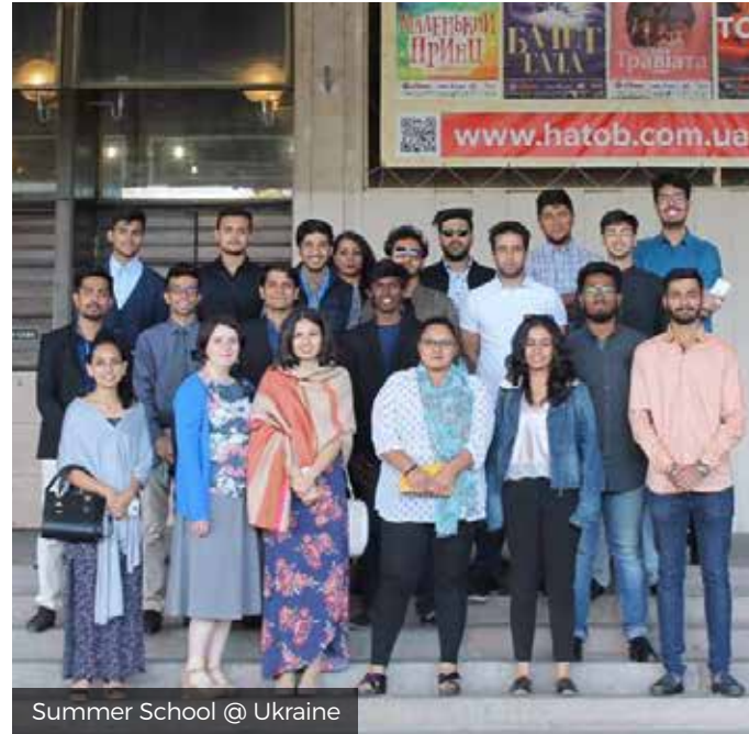
Summer School @ Ukraine

Students of School of Law attended a Summer School Programme in Ukraine and Poland organized in association with Ukrainian Ministry of Education. Topics covered were on history and culture of the two countries pre and post-Soviet period, integration of European Union, public international law, politics and the role of mass media, and on the economy of Ukraine.